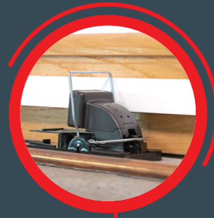
Rat Riddance Connect

Allows for strategic external baiting to monitor and control target rodents 365 days of the year, whilst reducing the risk of non target species poisoning.