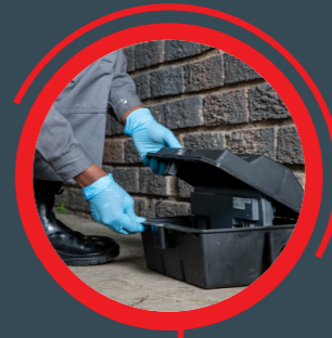
Dual AutoGate Connect

*Use biocides safely. Always read the label and product information before use.